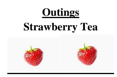
Thursday 19th July 2018

Please note, if you have joined WRSG since January 2018, you do not need to renew at this time.