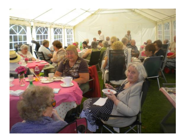
Llandudno Day Trip (Thursday 23<sup>rd</sup> June 2016) Our members enjoyed a great day out in Llandudno, the jewel of North Wales.